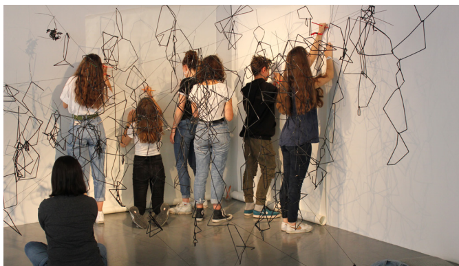
Making Connections Summer School