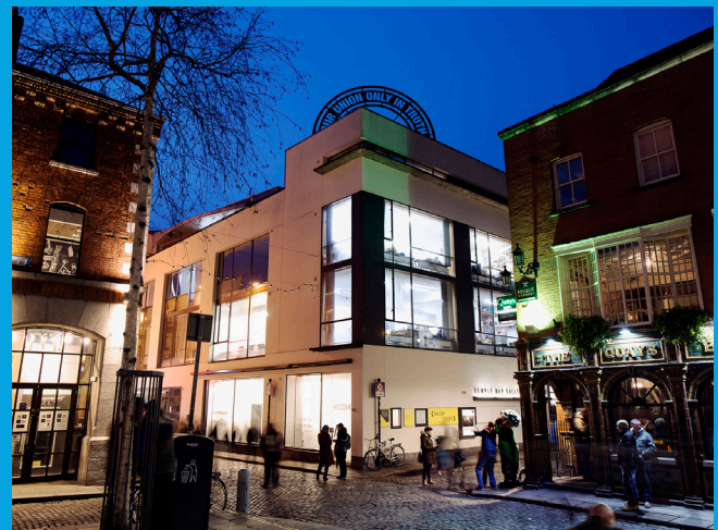
Temple Bar Gallery + Studios Exterior.

of TBG+S's current strategic plan (2016-2019) have increased its capacity to deliver its artistic programme. When TBG+S joined the Fellowship, they were committed to developing a culture of fundraising to achieve sustainable and diversified income streams.